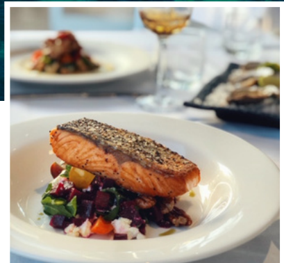
EAT & DRINK